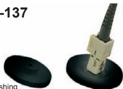
Item #: 902-260